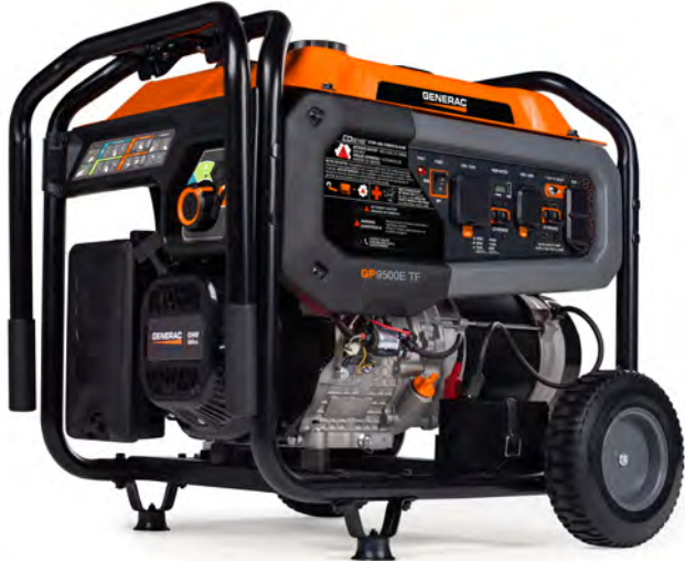
Photograph may not represent actual content.

Model 8063-0 UPC: 696471104523 (49 State)